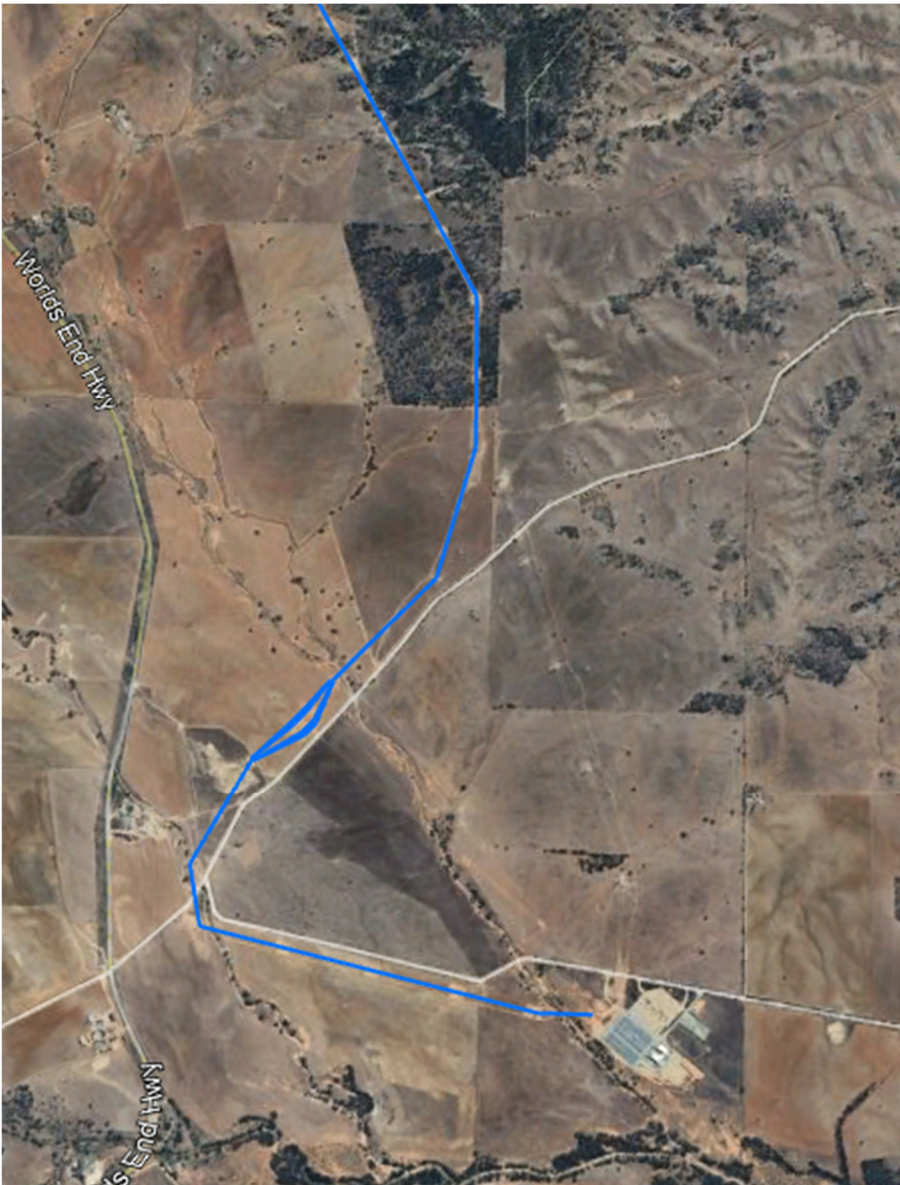
Diagram A1-2 – Robertstown Substation close up